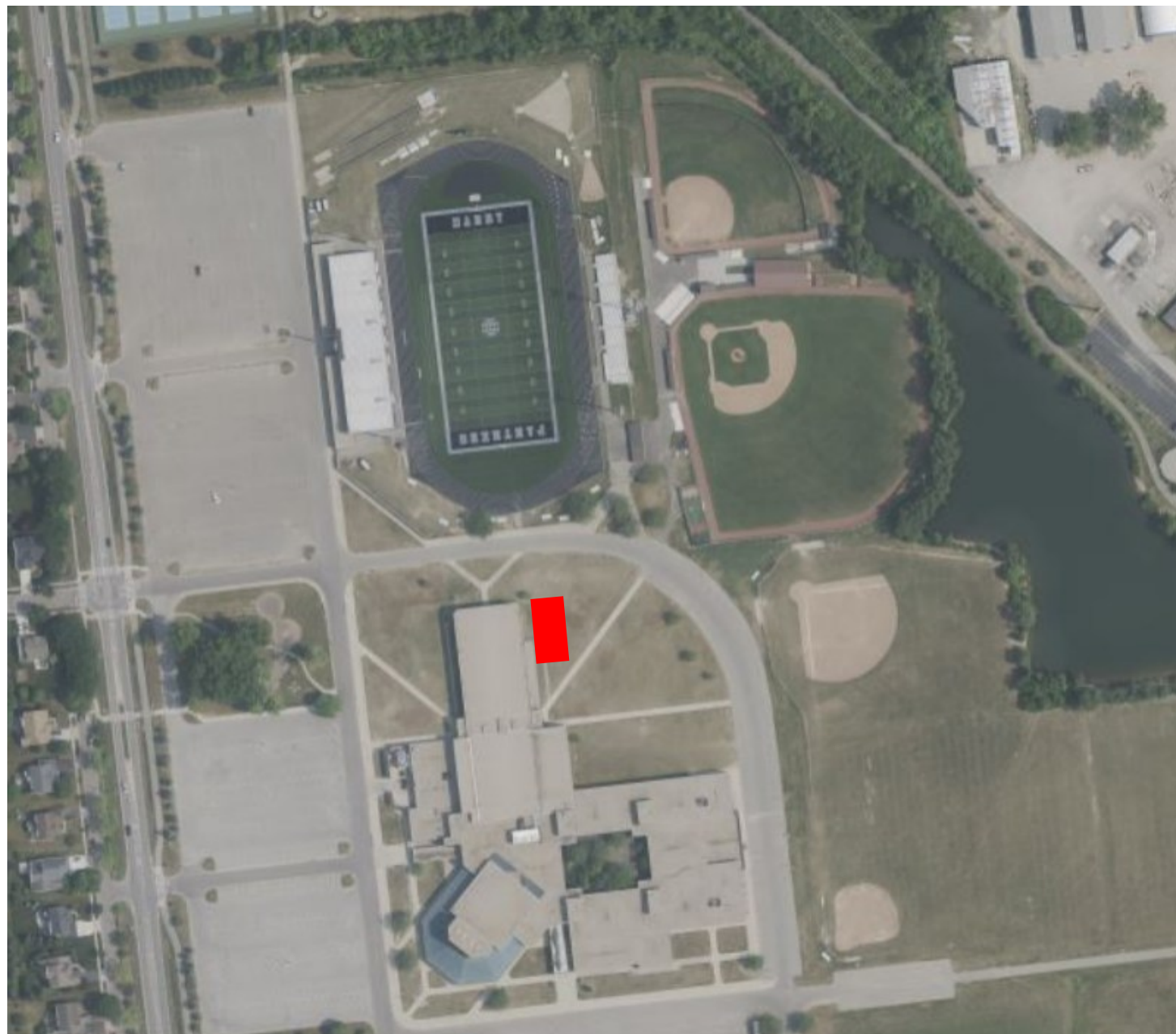
Aerial view of Darby High School