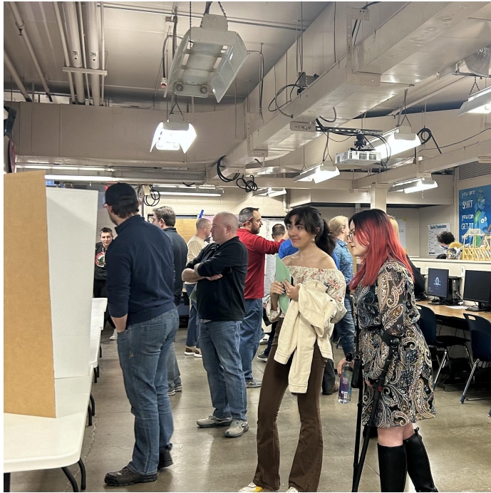
Poster room where sharks had the opportunity to interact with each project