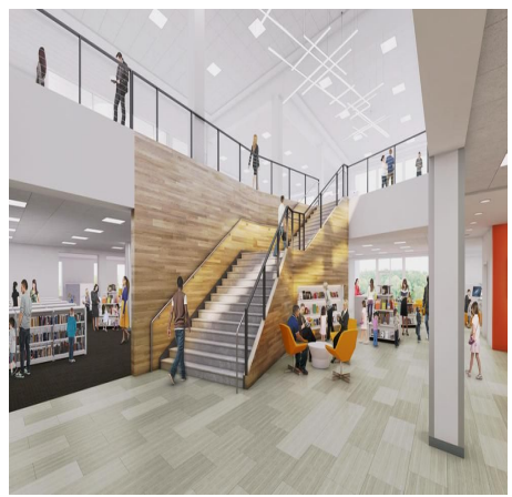
https://www.columbuslibrary.org/si tes/default/files/042318_Library_to _dedicate_new_Hilliard_Branch.p df