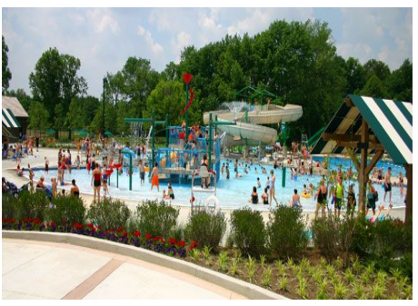
http://dublinohiousa.gov/pools If you live in Dublin, Ohio, the Dublin South pool is a great place to spend some of your summer.