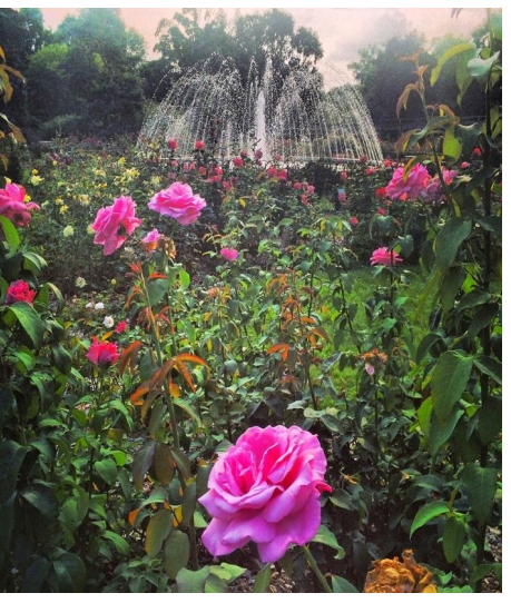
The Park of Roses is a popular wedding spot with many different beautiful flowers. Find out more on:<u>https://www.parkofroses.org</u>